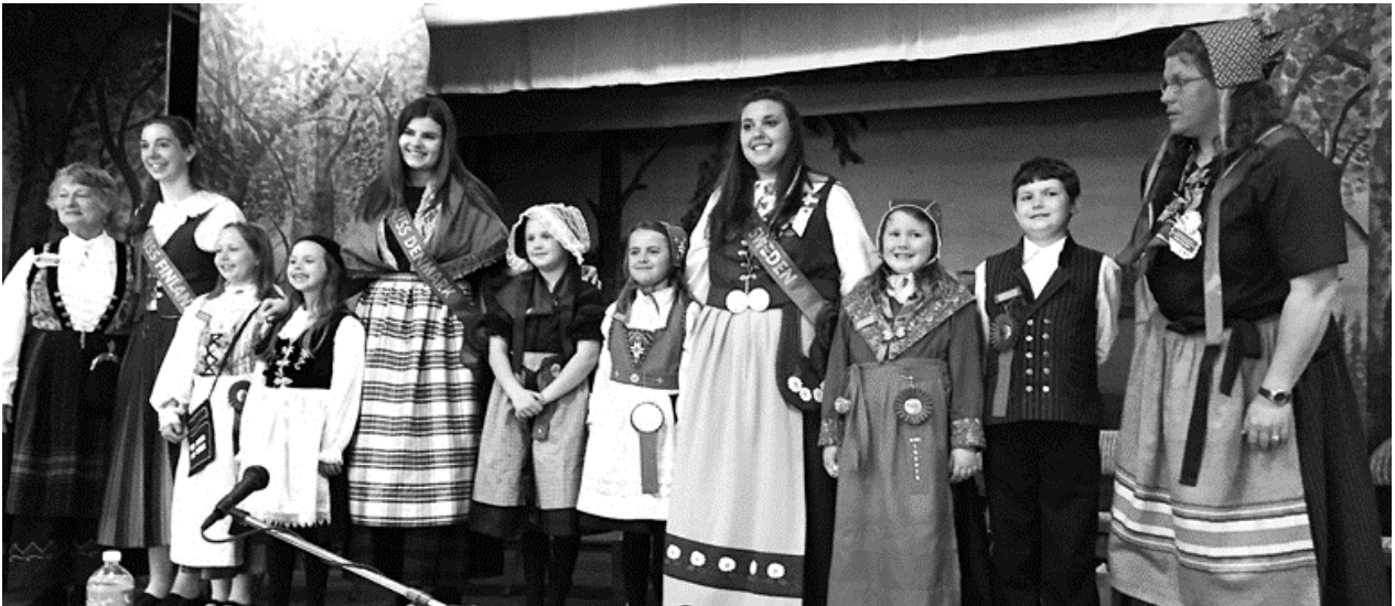
2017 Scandinavian Court at Suomi Hall during the May meeting